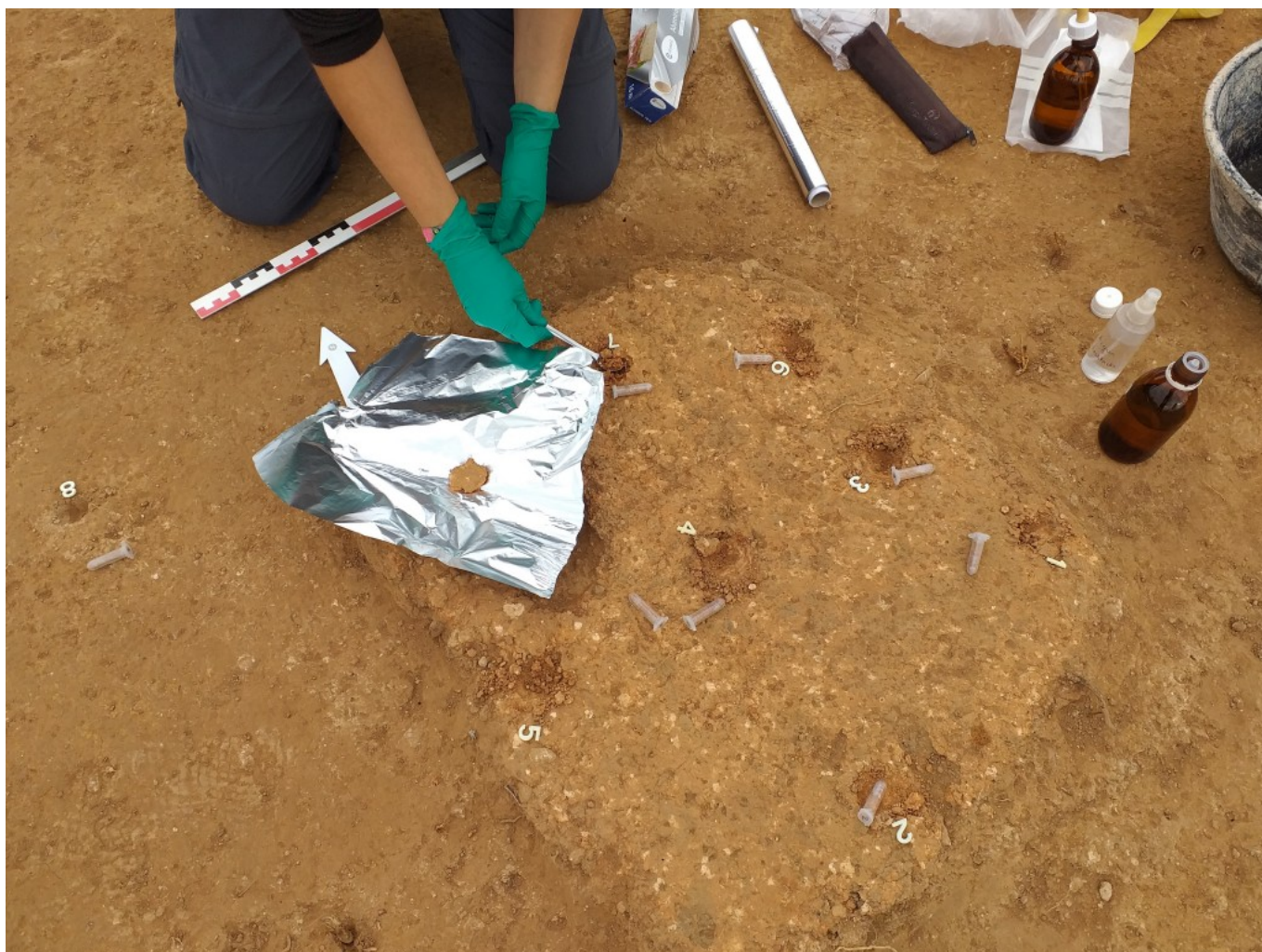
Collection of samples for the interdisciplinary analysis on a fireplace from the Iberian archaeological site in Castellet de Banyoles (Tivissa, Tarragona).

In the Memoria 2020 report, you can check all data concerning the ICAC activity in 2020, and in more detail the scientific output of each ICAC researcher.