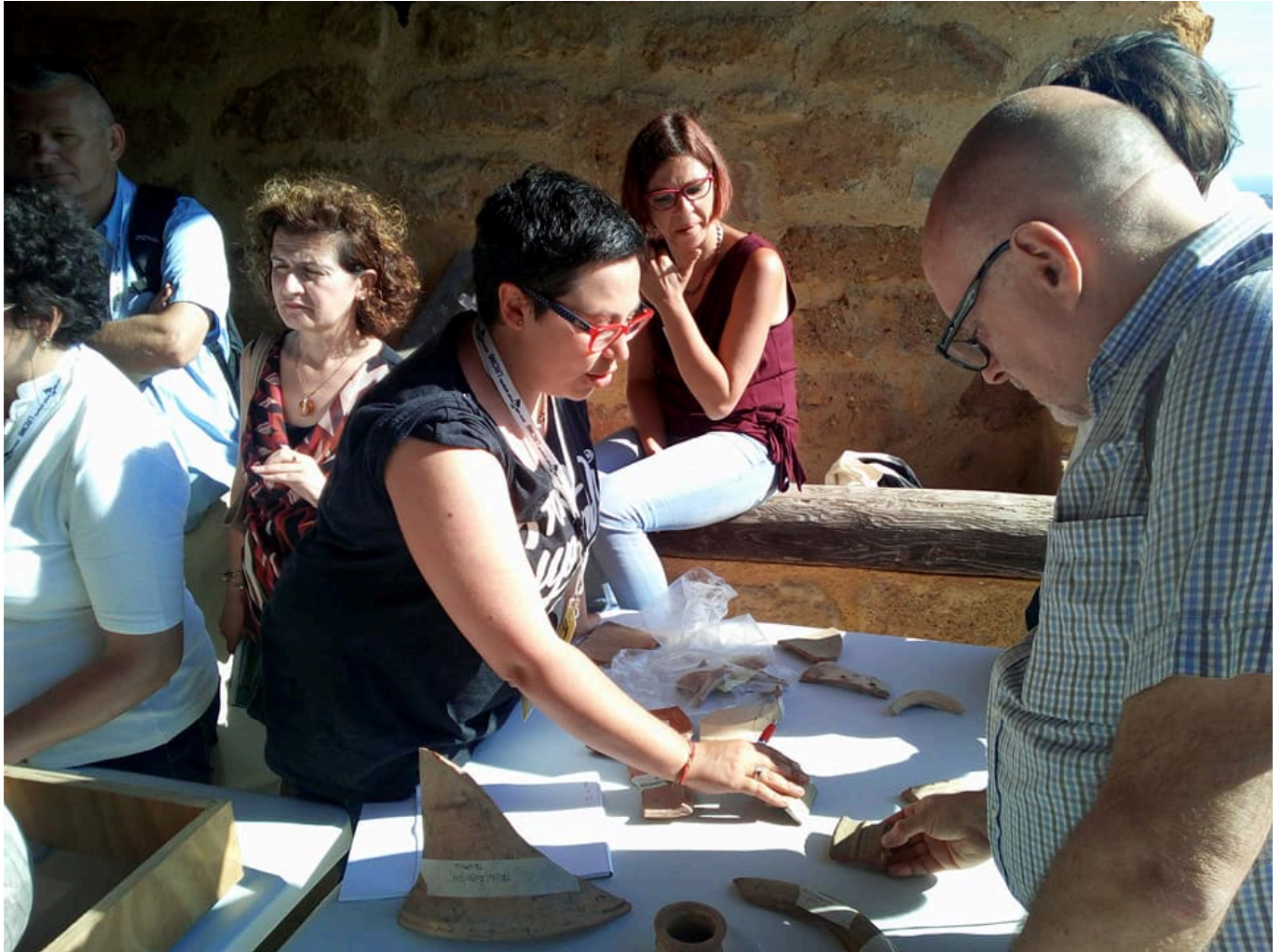
Activity during the LRCW 6th edition (Agrigento, Italy)