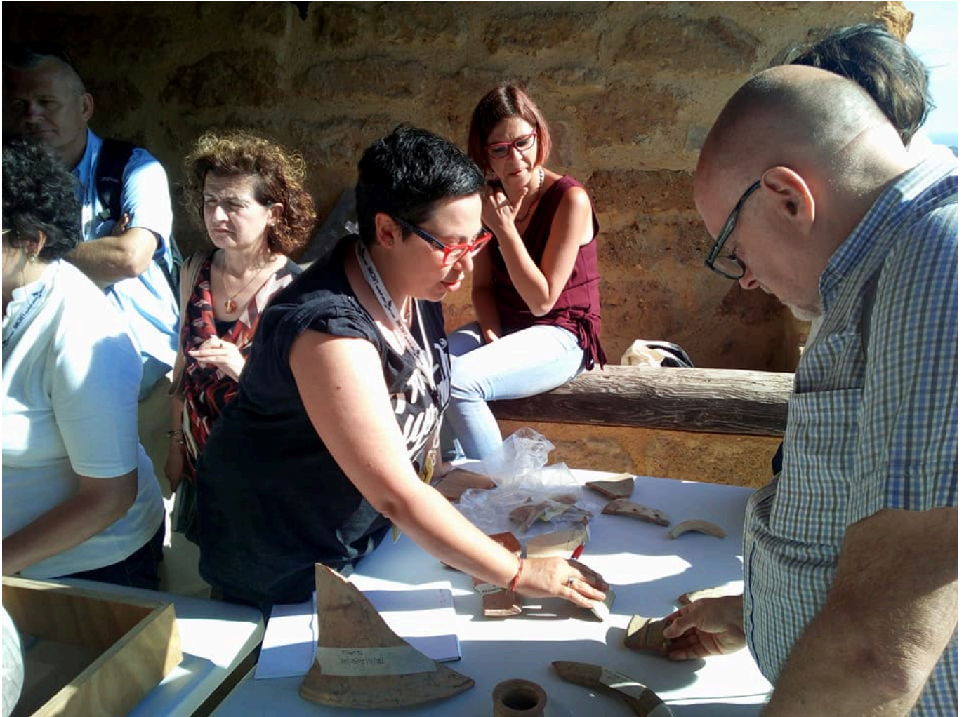
Activity during the LRCW 6th edition (Agrigento, Italy)