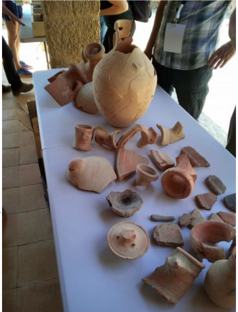
LRCW6 (Agrigento, Italia)