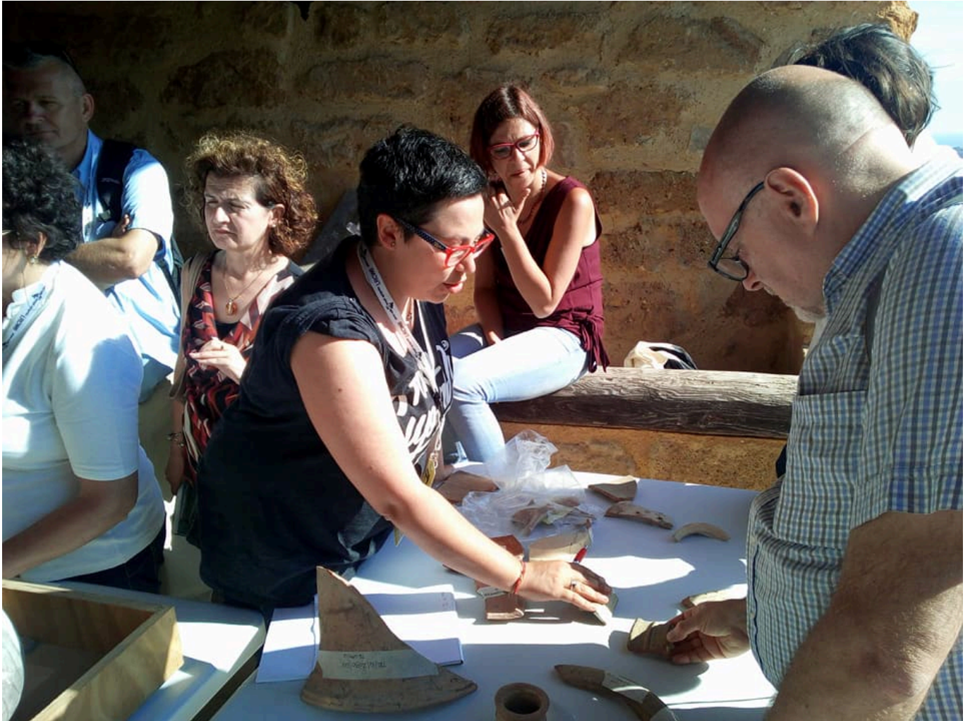
Activity during the LRCW 6th edition (Agrigento, Italy)