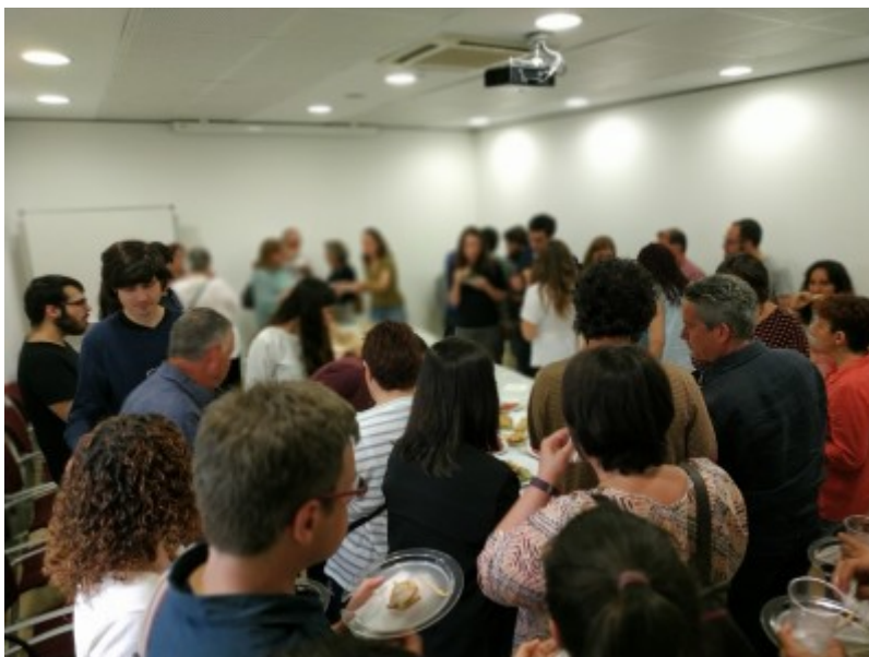
Participants in the IV Seminar on Epigraphy and Archaeometry at the ICAC