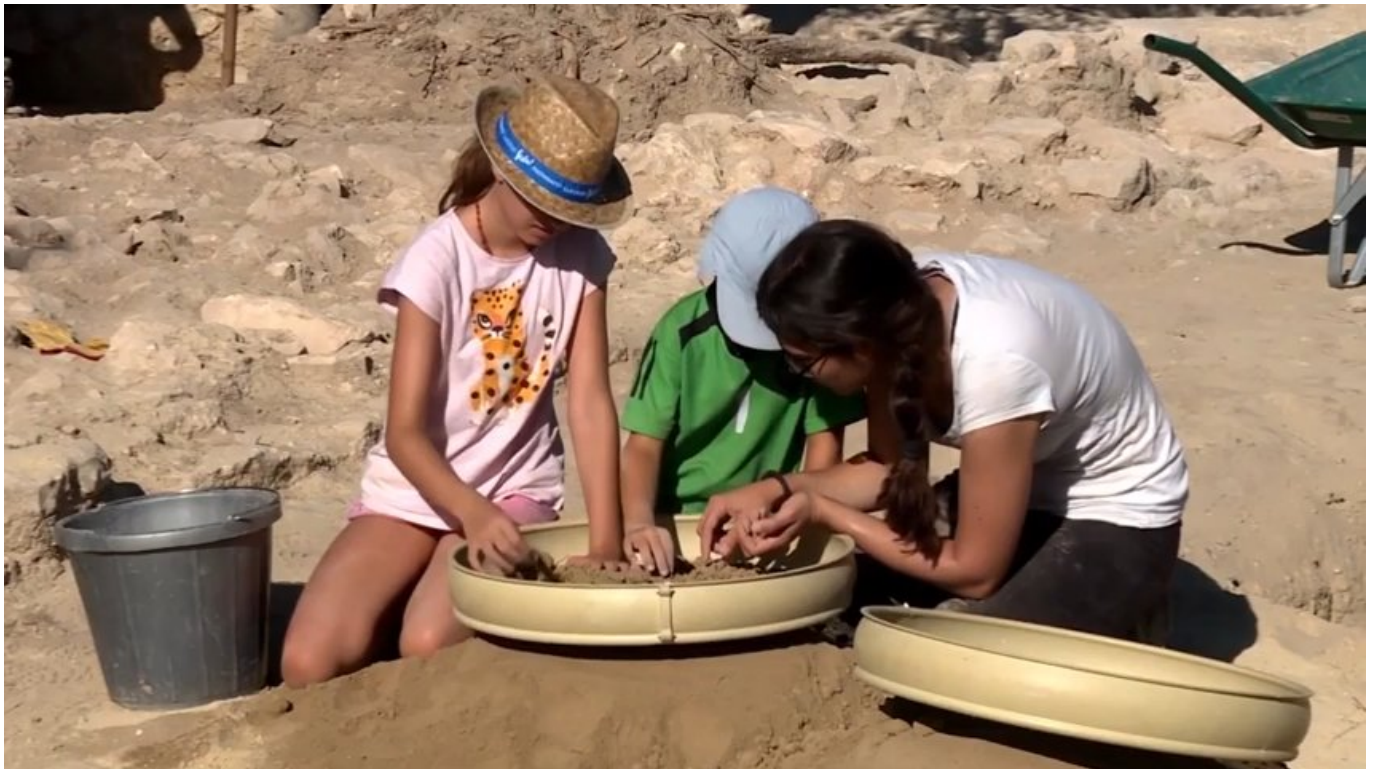
Dissemination activity during the IV Archaeology Summer Course in Valencia “la Vella” (2019).