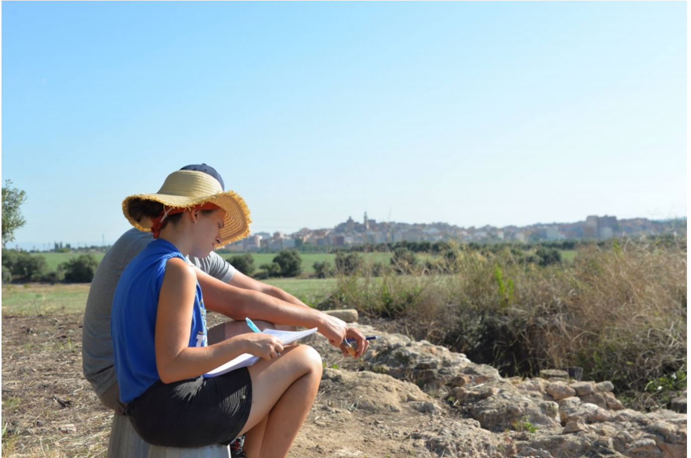
Training researchers working in the archaeological site of Mas dels Frares (2019).