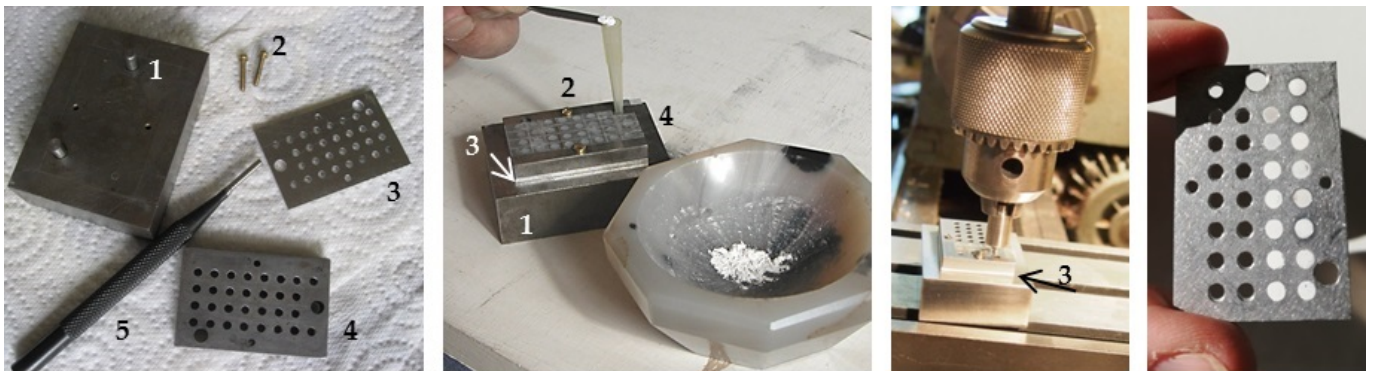
Sample preparation sequence for CL-quantitative analysis developed by Ph. Blanc at UPMC, Paris

The new method consists of preparing samples of the marble powder, and then place them on a plate specifically designed to be pressed and introduced into the scanning electron microscope (SEM) with an attached spectrometer. Thus, the specific spectra and the intensity of these spectra can be obtained for each of the samples.