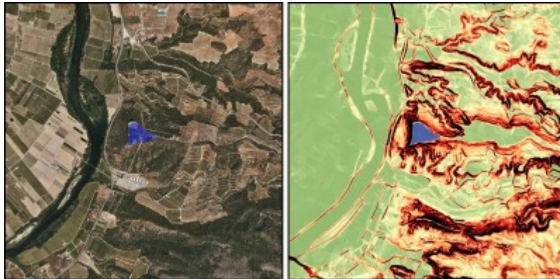
Example of GIS application to the study of fortifications. Castellet de Banyoles de Tivissa (Tarragona).