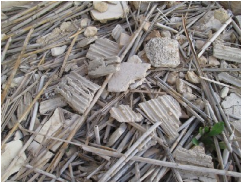
Constructions remains in a recently demolished building.