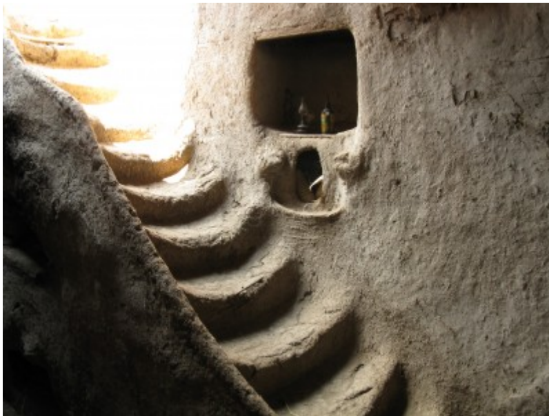
Cuurent example of adobe house, in Egipt.

7. Aportes etnoarqueológicos al estudio de la arquitectura doméstica de adobe. María Correas-Amador (independent researcher).