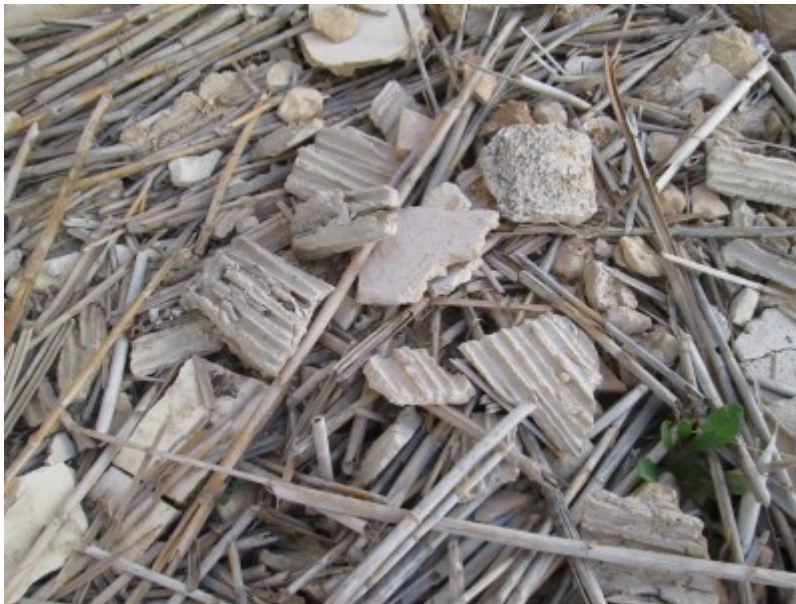
Constructions remains in a recently demolished building.