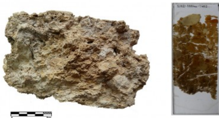
Fragment of a clay roof in the archaeological site of Sant Jaume - Mas d'en Serrà (Alcanar, Montsià).