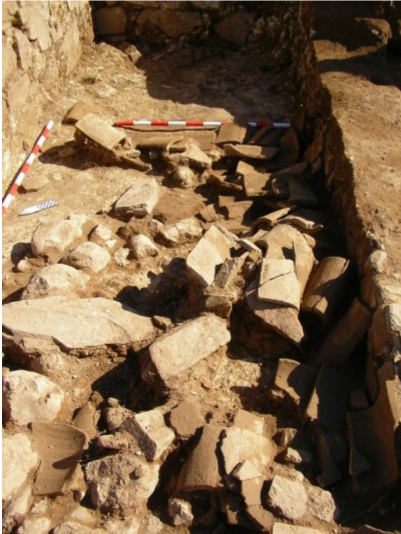
Demolition of Can Tacó tiles.