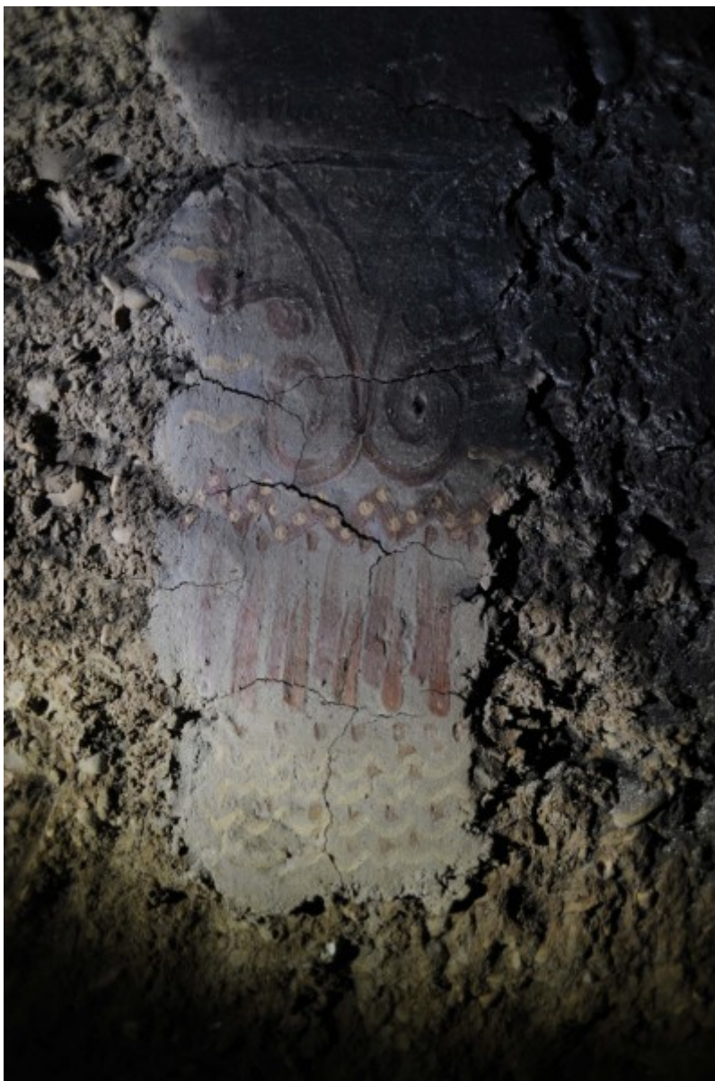
Burning down a cob wall with mud straw plaster and paintings. Ragewitz, Saxony-Anhalt, 2013.