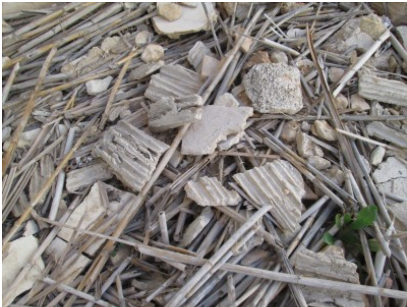
Constructions remains in a recently demolished building.