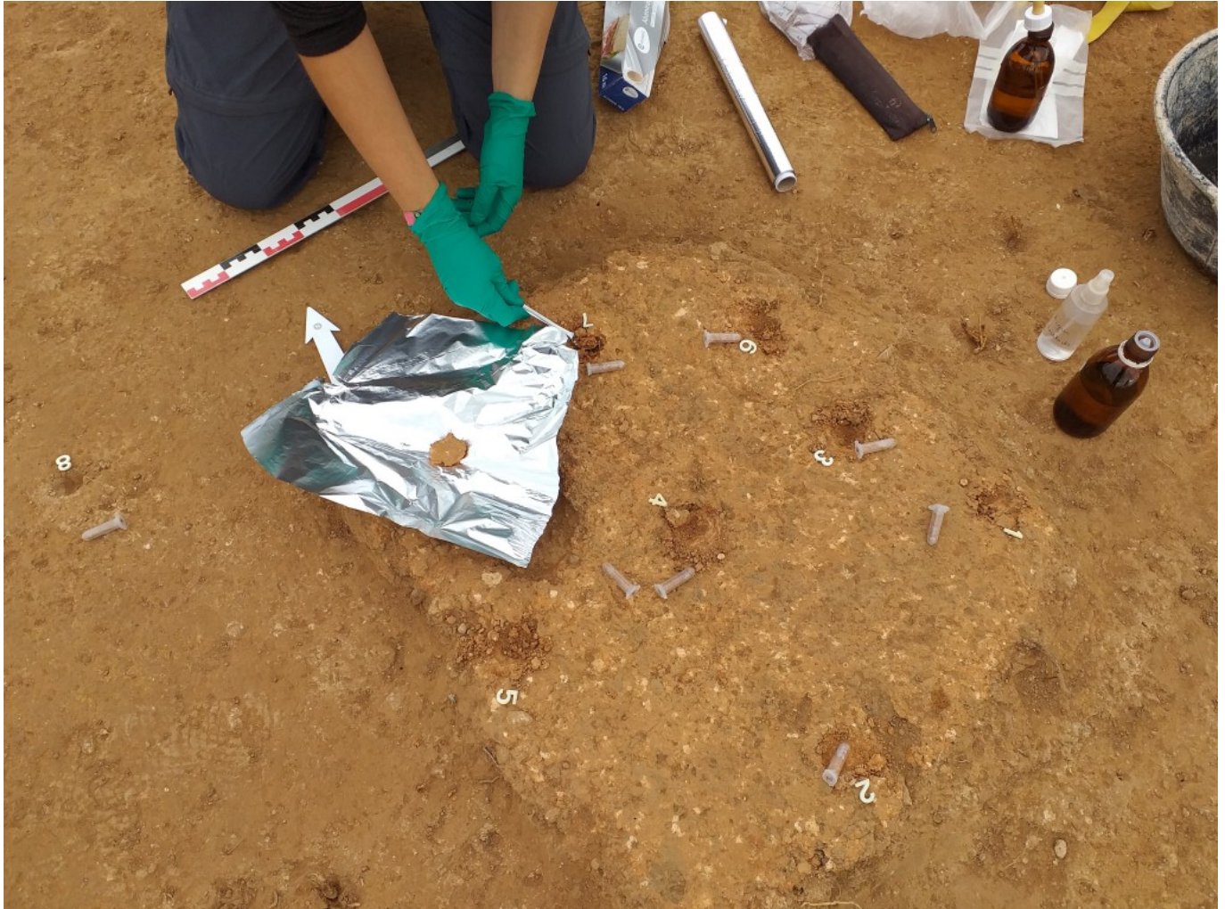
Collection of samples for the interdisciplinary analysis on a fireplace from the Iberian archaeological site in Castellet de Banyoles (Tivissa, Tarragona). Picture of Project TRANSCOMB (ICAC), led by Maria Carme Belarte (ICREA-ICAC).

In the Memoria 2020 report, you can check all data concerning the ICAC activity in 2020, and in more detail the scientific output of each ICAC researcher.