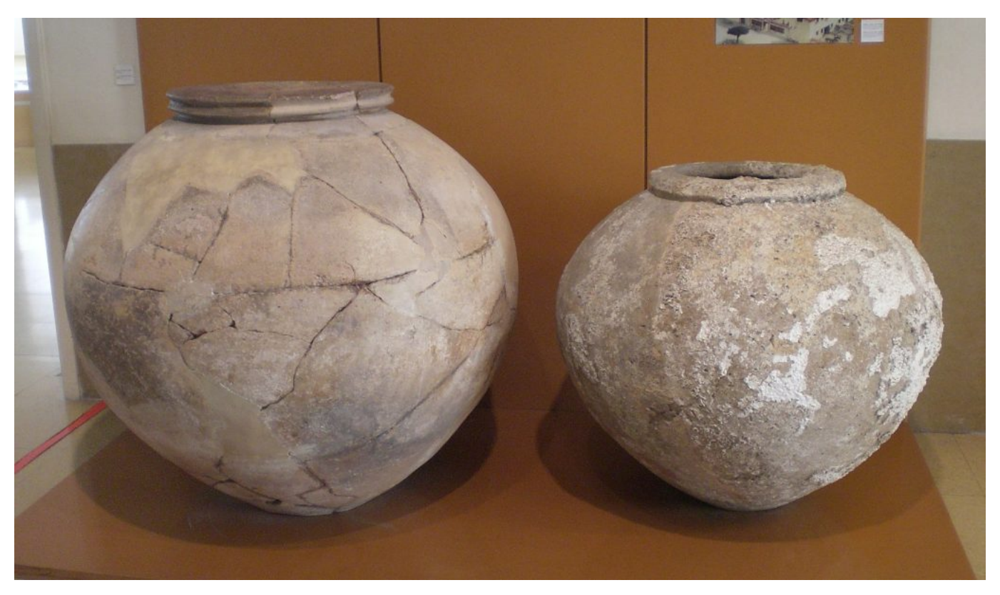
Image of two dolia exhibited in the old permanent exhibition of the MNAT.