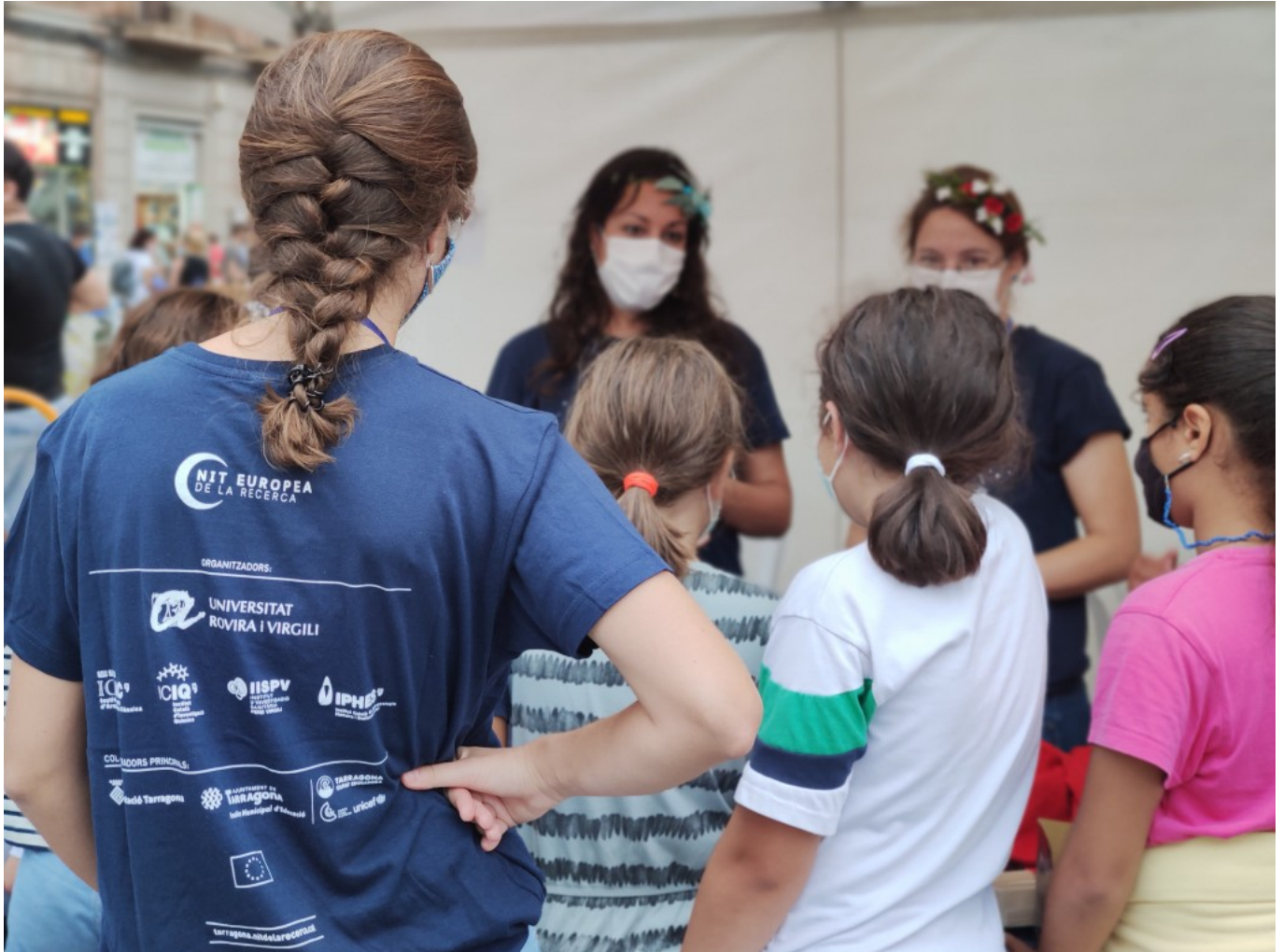
Imagen de un taller de divulgación del ICAC en la Noche de la Investigación, edición 2021.