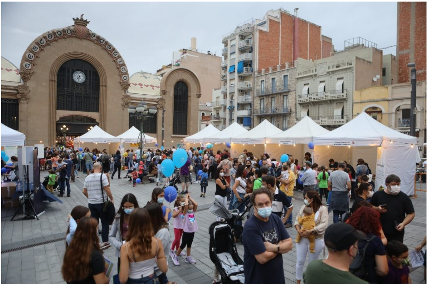
Imagen de la plaza Corsini durante la celebración de la European Researchers Night 2021.

The Tarragona City Council , through the Europe Direct Tarragona office, is the main sponsor of the activity in Corsini Square, in collaboration with the Diputació de Tarragona . It has also received support from the Tarragona Central Market and the company Borges.