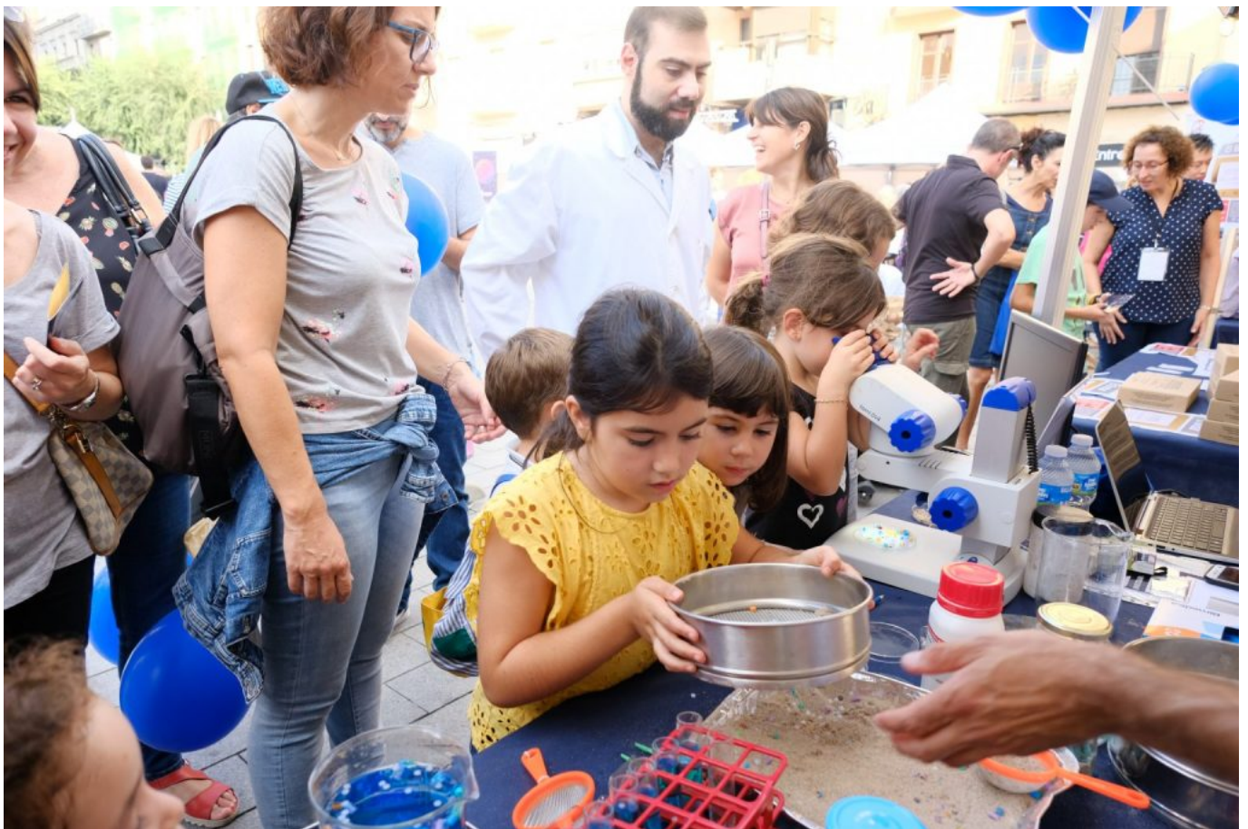
Imagen de uno de los talleres que se hicieron en la edición de 2021.

establishing itself over these six years. The aim of the European Researchers' Night is to bring research and its protagonists closer to audiences of all ages and to promote research and innovation in a clear and understandable language.