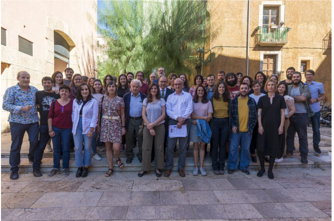
Group photo on the day of the celebration of the 20th anniversary of ICAC (October 2022).