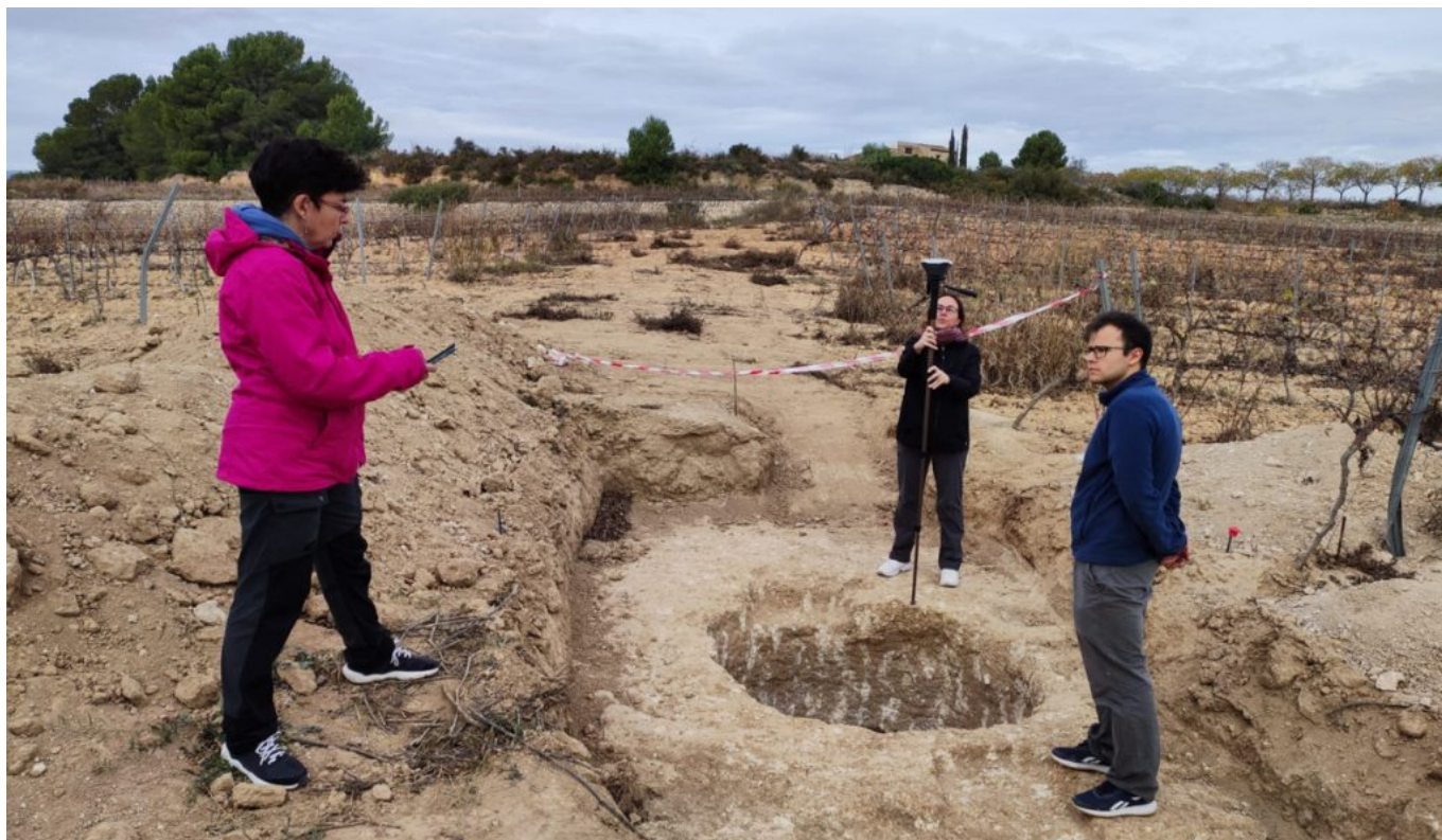
Topographical work at the archaeological site, with Mas Cap de Ferro in the background.

The intervention is expected to last for two weeks and involve a team of around ten people. In addition to ICAC researchers and assistant archaeologists, researchers from the University of Lleida (UdL), students from the Master's program in Applied Classical Archaeology, MACA (URV-ICAC-UAB), and undergraduate students in History at UdL will also participate.