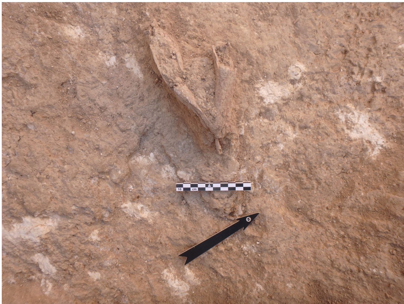
Remains of fauna were found at the bottom of one of the silos at the Mas Cap de Ferro site during the 2023 campaign.

The two main objectives of the 2023 campaign are, on one hand, the excavation of the remaining five silos, and on the other hand, the delineation of the site using mechanical trenches and extensive opening to determine the actual dimensions of the site, which have been unknown until now.