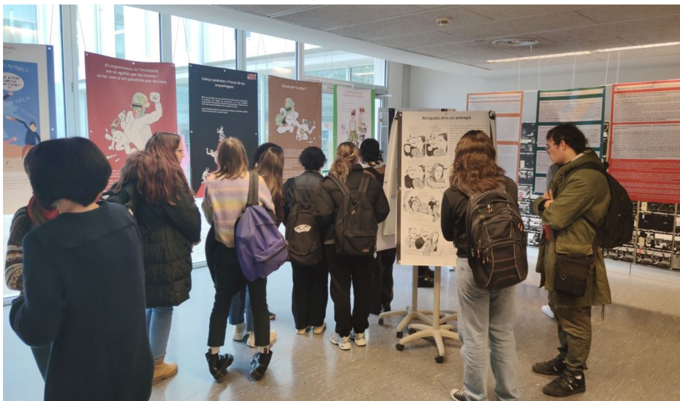
The traveling exhibition “Arqueosexisme” began its journey at the CRAI Campus Catalunya (Tarragona), in December 2023.

The ‘Archaeosexism’ exhibition promotes gender equality in the field of research while fostering scientific culture