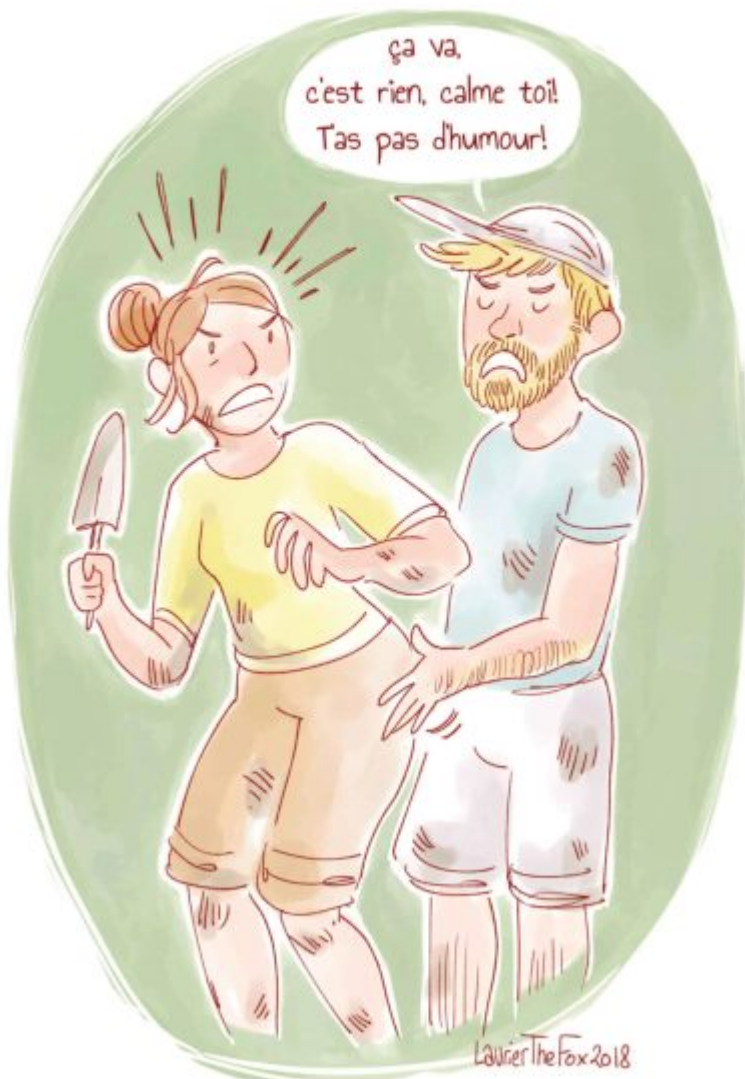
One of the images from the exhibition 'Archaeosexism'. Illustration by Laurier the Fox.

“Em va posar la mà al cul. Li vaig dir que no ho tornés a fer i em va contestar: