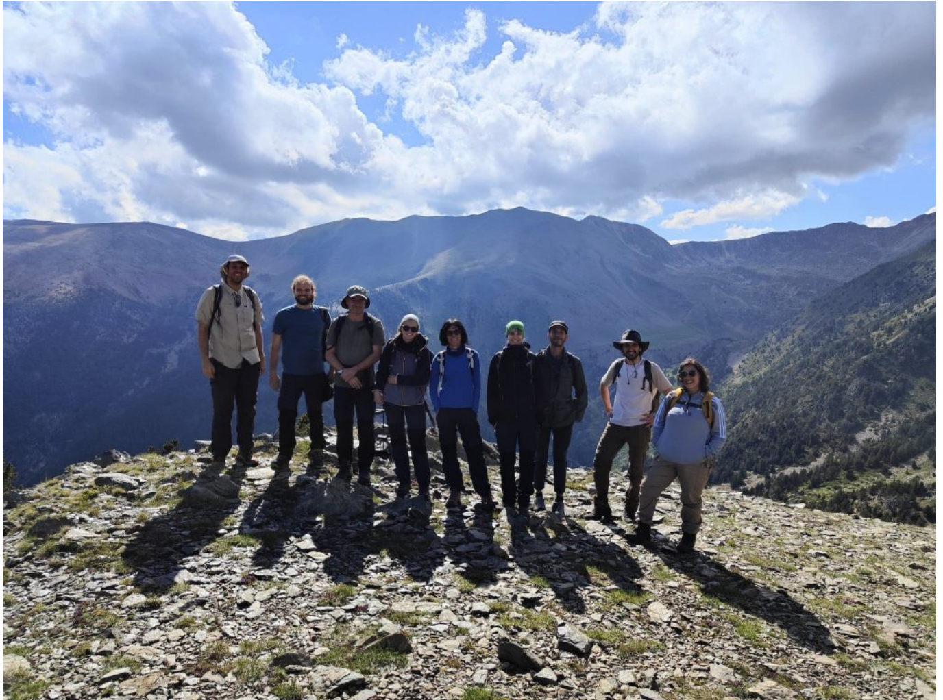
A group of GIAP members is excavating at the Coll de Molleres I archaeological site since Sunday, July 7.

ICAC-CERCA collaborates with this and other local entities to ensure the transfer of knowledge from its research and the enhancement of the cultural landscape heritage, especially through the European project Interreg Sudoe Cultur-Monts , which aims to be a resource for sustainable territorial development and tourism.