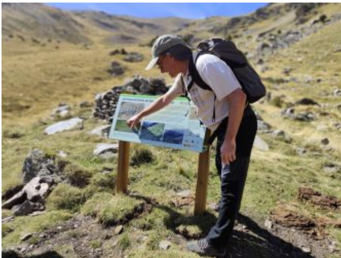
Una de les iniciatives de transferència que s'estan desenvolupant a la Vall de Núria és el projecte ArqueoPirenaia, que aquest 2024 començarà una segona fase.