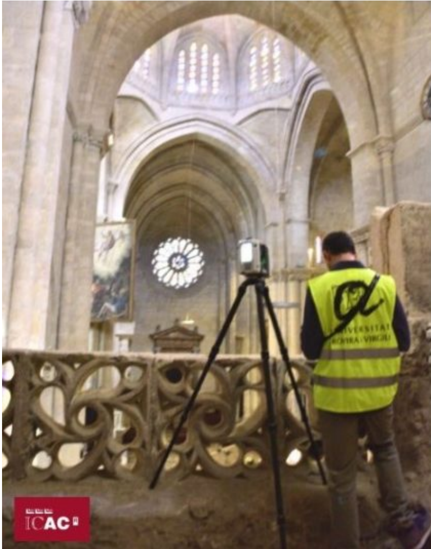
catedral maig 2024 (2) - 1