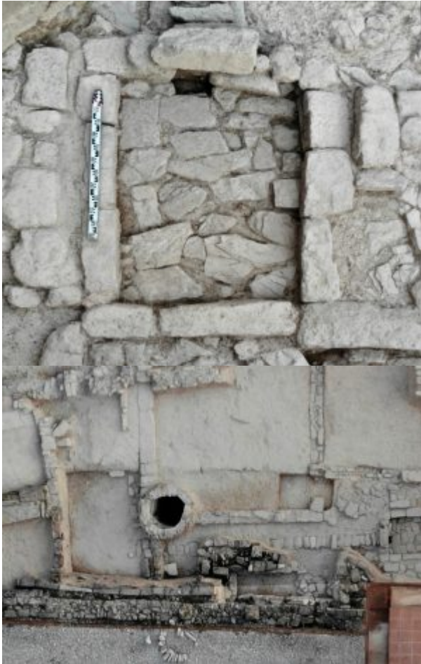
Imatge aèria de Iesso, 2021.