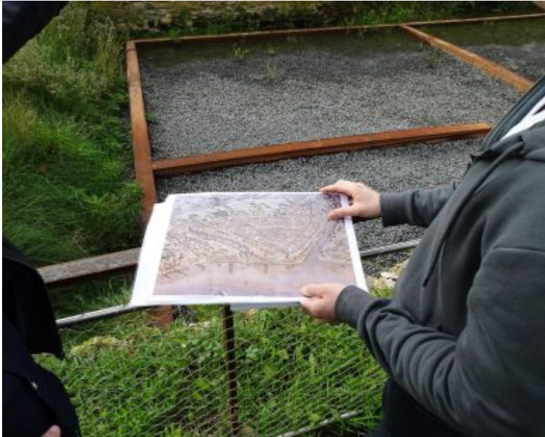
Visit to the archaeological remains at Lattara (Musée Henri Prades, Lattes, Hérault)

This research visiting was made possible thanks to a mobility grant from the Spanish Ministry of Science, Innovation, and Universities . The grant is aimed at FPU program researchers to complement their academic training.