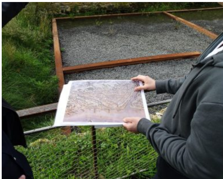
Visit to the archaeological remains at Lattara (Musée Henri Prades, Lattes, Hérault)

This research visiting was made possible thanks to a mobility grant from the Spanish Ministry of Science, Innovation, and Universities . The grant is aimed at FPU program researchers to complement their academic training.