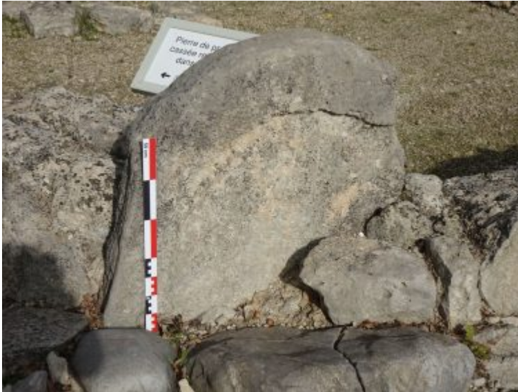
Press bed reused in a wall from îlot 8 at the Oppidum of Entremont (Aix-en-Provence, Bouches-du-Rhône)