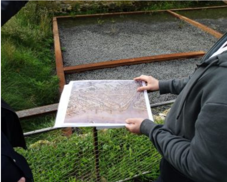
Visit to the archaeological remains at Lattara (Musée Henri Prades, Lattes, Hérault)

This research visiting was made possible thanks to a mobility grant from the Spanish Ministry of Science, Innovation, and Universities . The grant is aimed at FPU program researchers to complement their academic training.