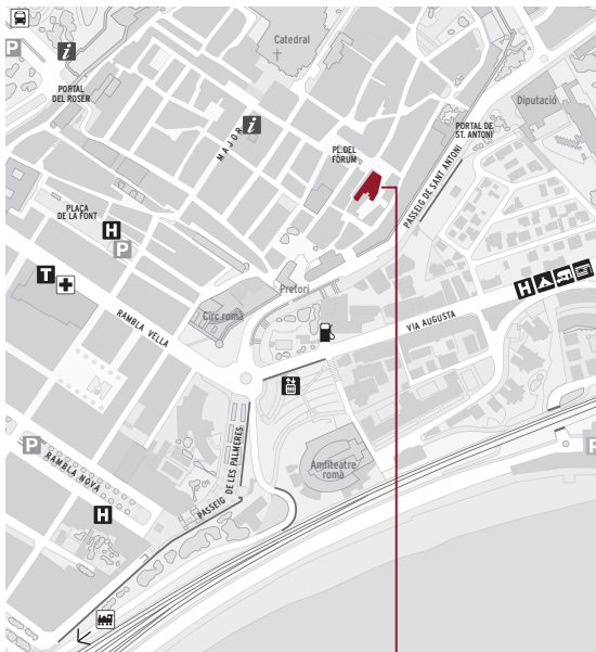
Catalan Institute of Classical Archaeology (ICAC)